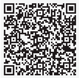
Scan for video